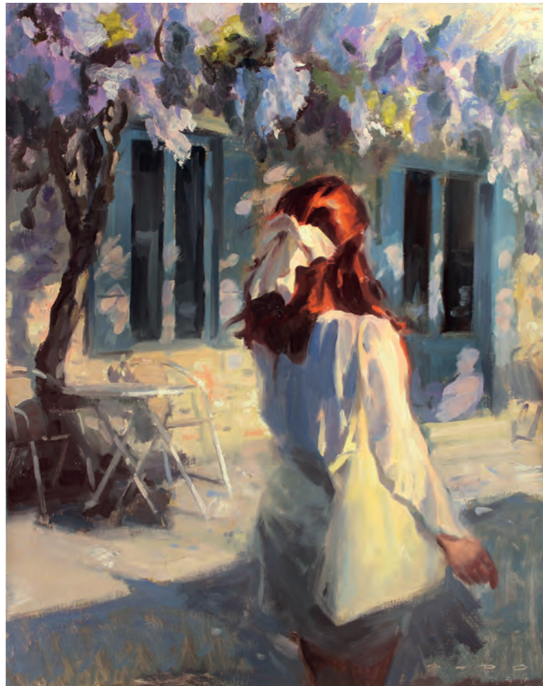
Glycine Violet Oil on canvas 36 x 28 inches