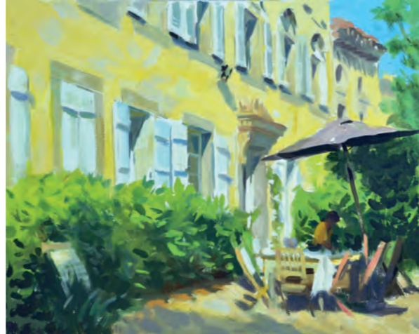
Domaine Des Jasses Oil on canvas 16 x 20 inches