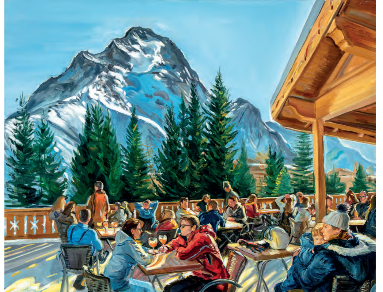
A Moment of Bliss Oil on canvas 25 x 32 inches