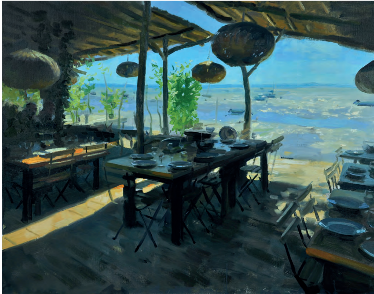
Cabane D'huitres, Arcachon Oil on canvas 28 x 36 inches