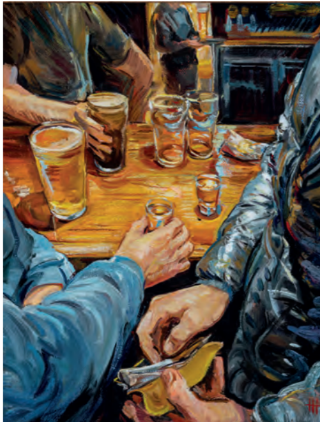
Nocturnal Spirits Oil on canvas 17.5 x 14 inches (left)