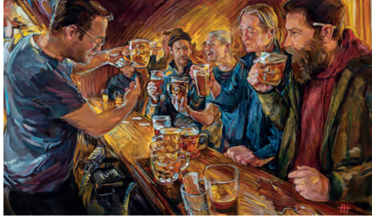
Tapping the Admiral Oil on canvas 20 x 34 inches