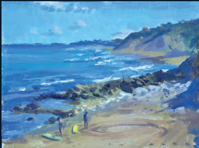
ALDO BALDING Bidart Oil on canvas 9.5 x 12 inches