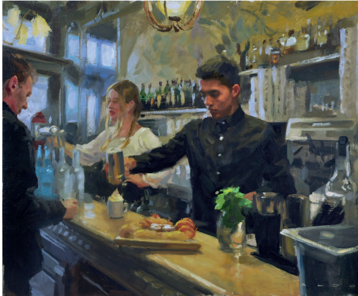
Petit Dejeuner, Toulouse Oil on canvas 29 x 21 inches