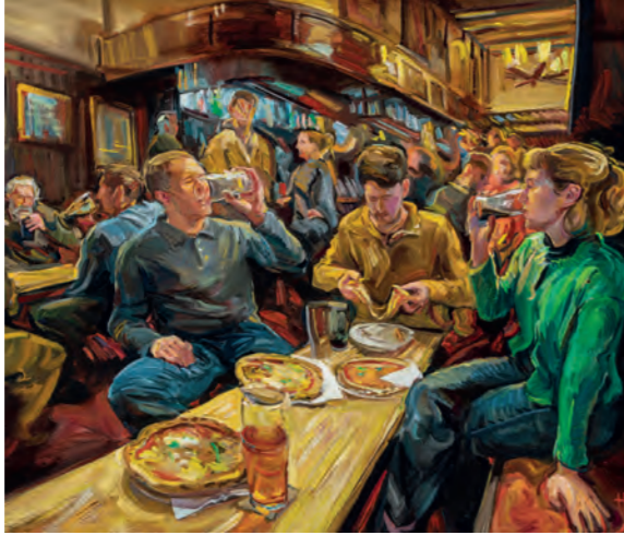
Van Dough Oil on canvas 23 x 27.5 inches