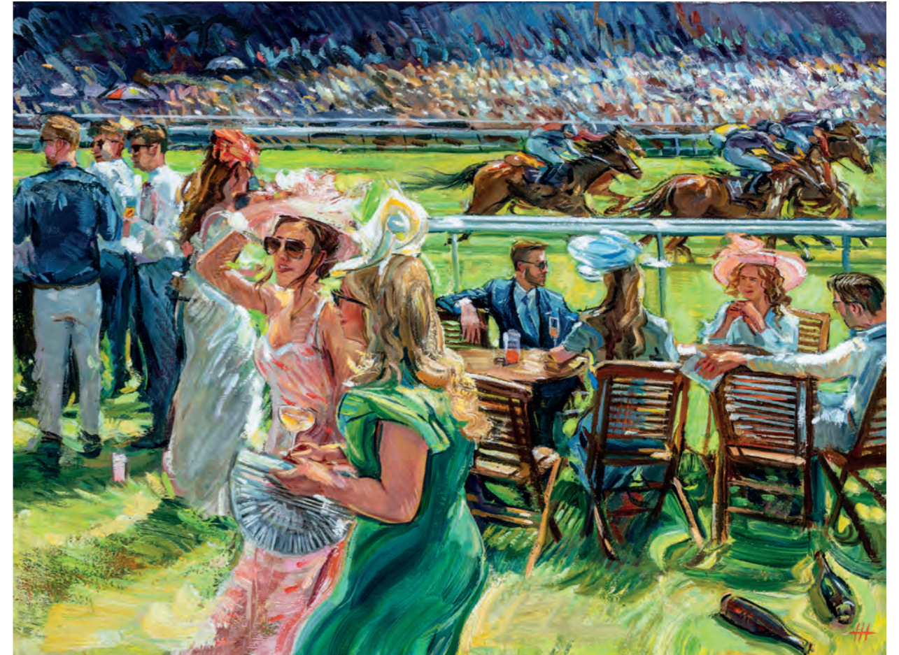
Race Day, Ascot 2022 Oil on canvas 23 x 29 inches