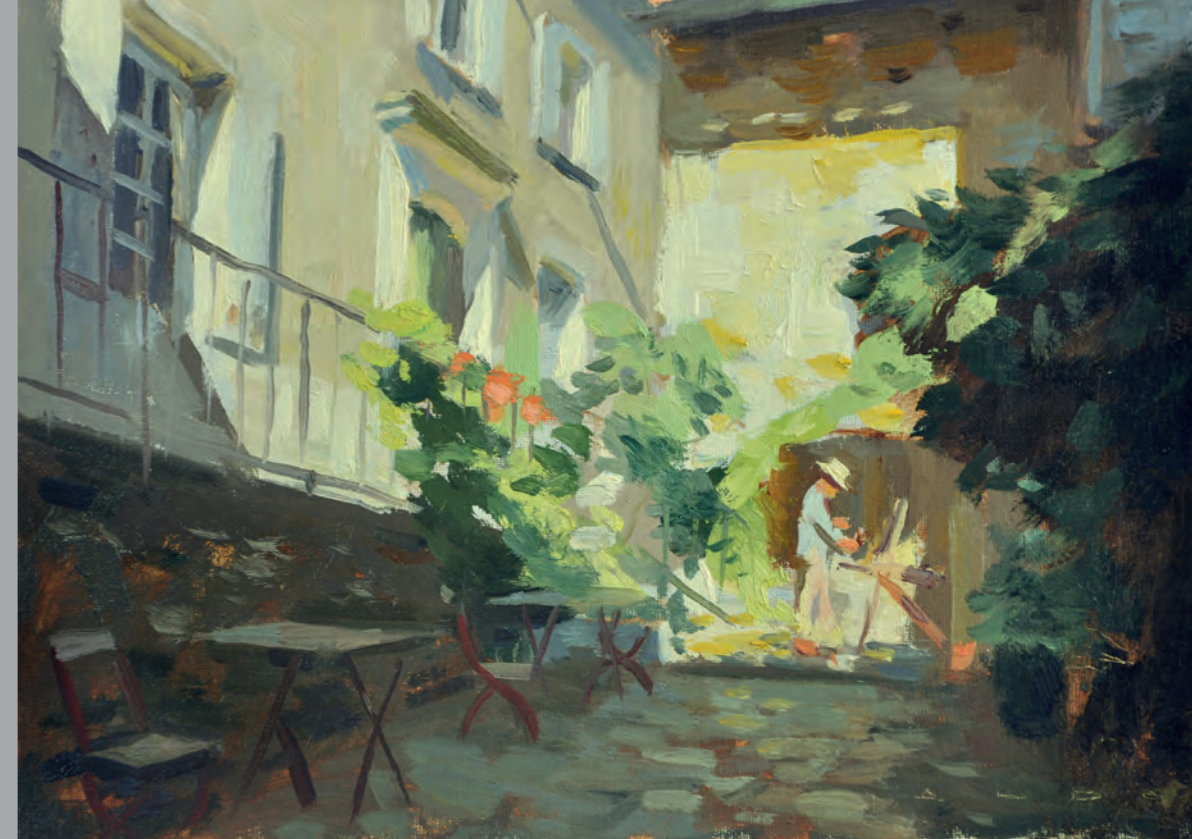
ALDO BALDING Les Cours à Domaine d'Audoubert Oil on canvas 13 x 10 inches

Lewis and Aldo masterfully capture the atmosphere of a scene, be it a busy pub scene or a tranquil French interior, bringing a 21st-century approach to traditional painting.