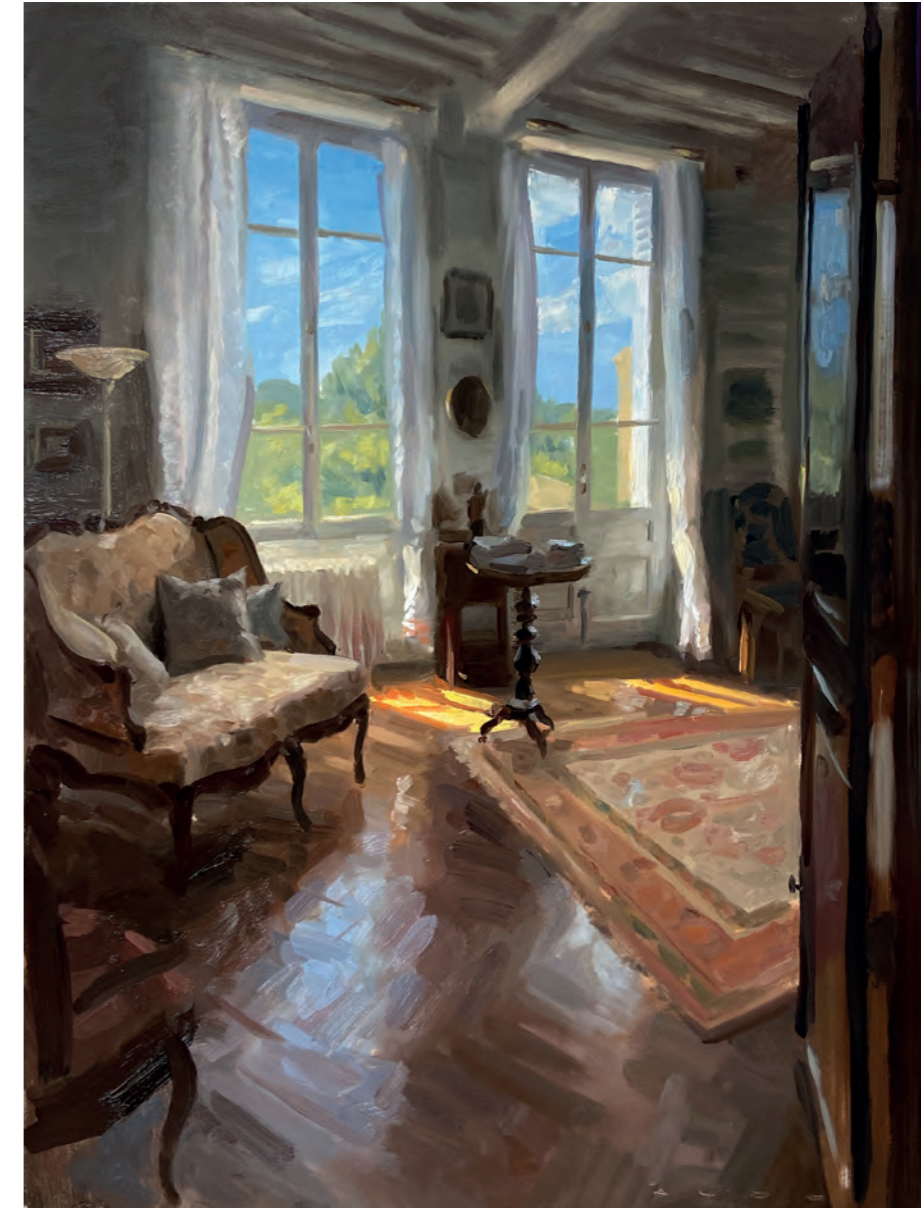
Intérieure à Chabeuil Oil on canvas 39.5 x 29.5 inches (right)