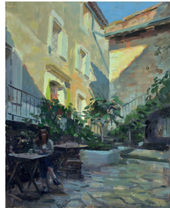
Domaine d'Audoubert Oil on canvas 24 x 20 inches