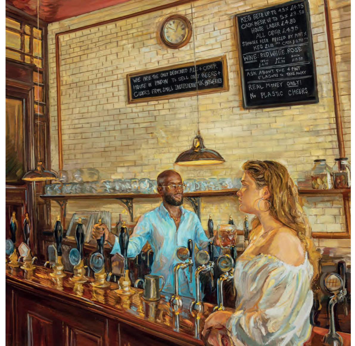
Up in the Arms Oil on canvas 39 x 39 inches