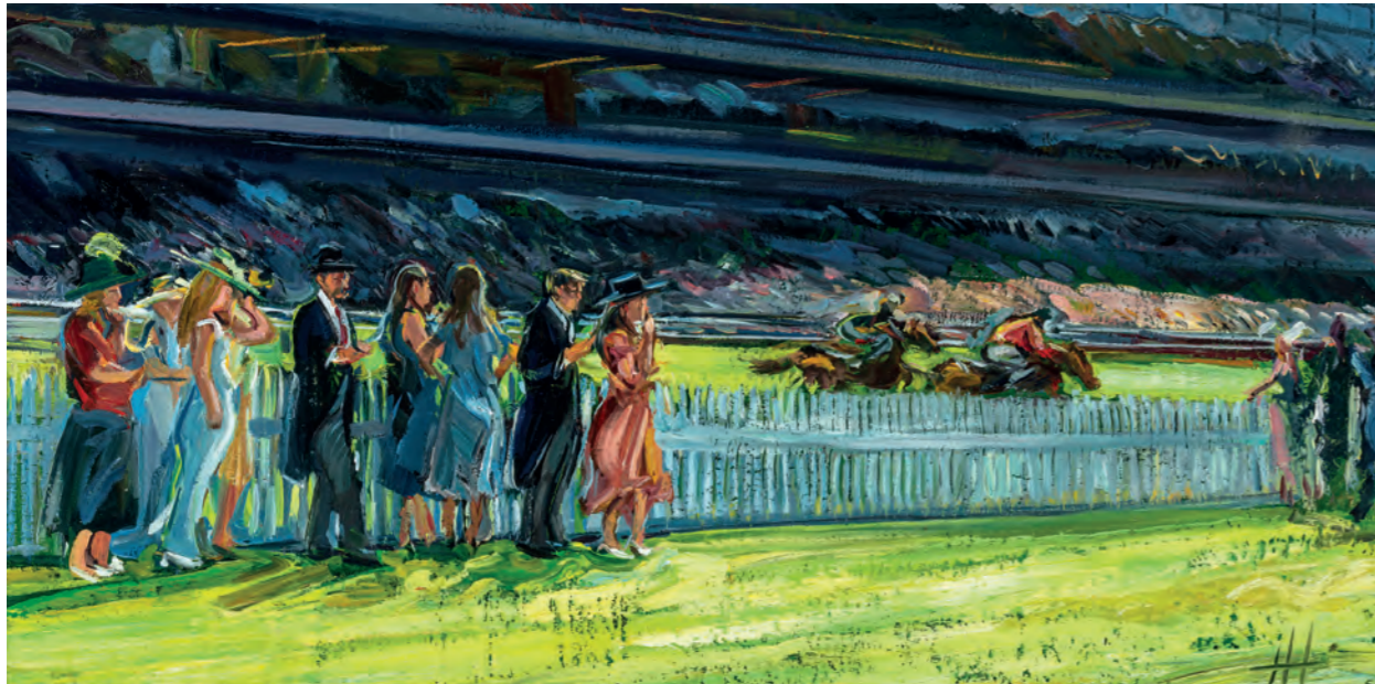
First Race, Ascot 2022 Oil on canvas 12 x 24 inches

Lewis's work is concerned with the craft of the artist's practice, mainly focusing on social rituals of gathering. Wielding exceptional painterly skill and a firm command of draughtsmanship, he produces scenes that are infused with wit and gritty realism.