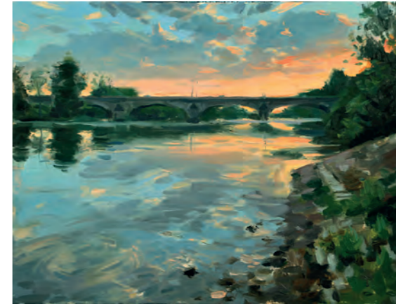
Pont à Orléans Oil on canvas 14 x 18 inches