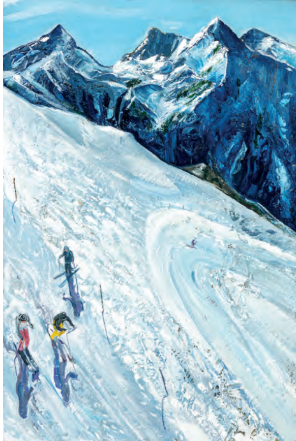
Les Deux Alps I Oil on canvas 36 x 24 inches