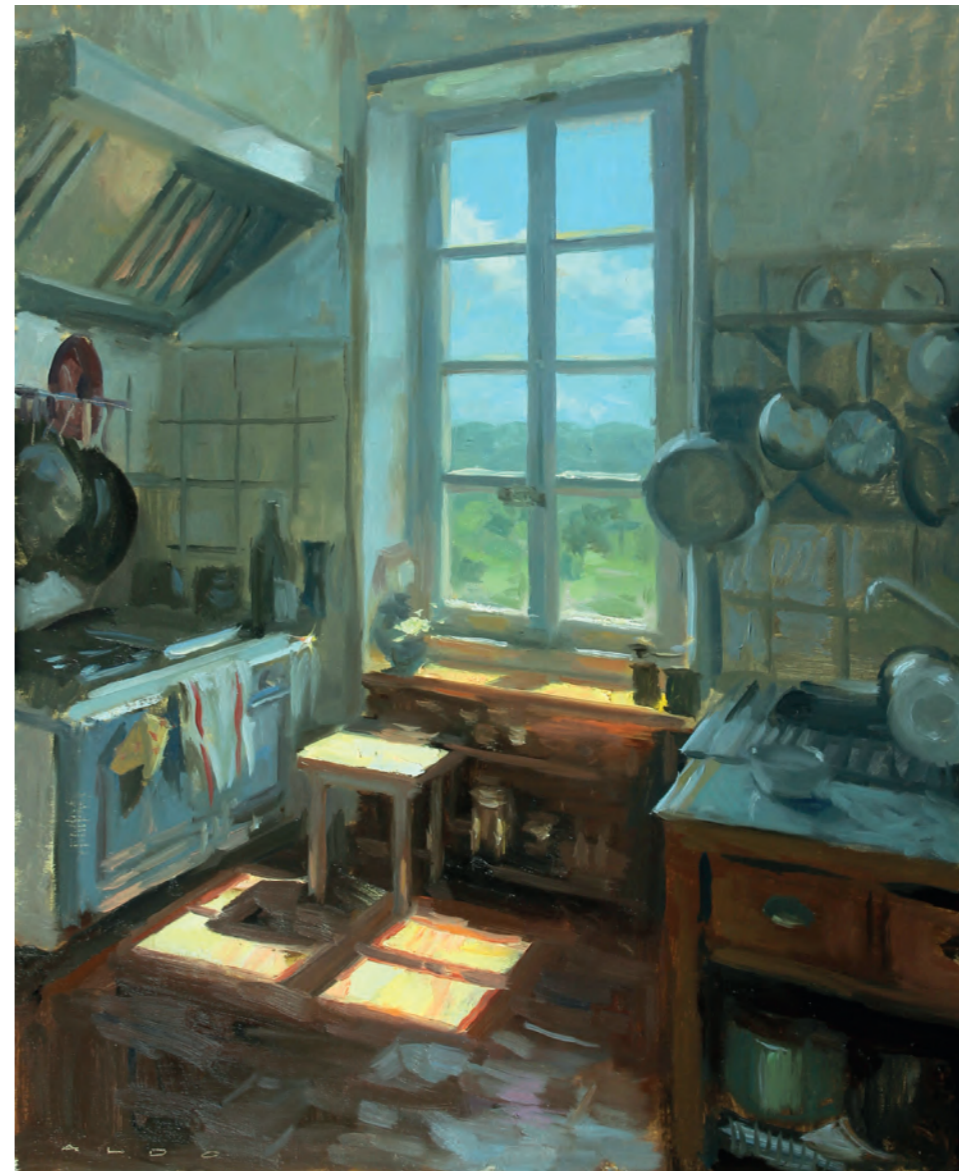
ALDO BALDING Domaine d'Audabiac Oil on canvas 24 x 20 inches