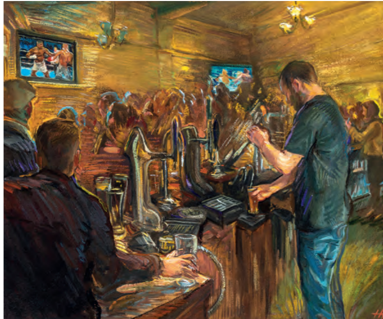
Heavy Weight to Carry Oil on canvas 20 x 24 inches