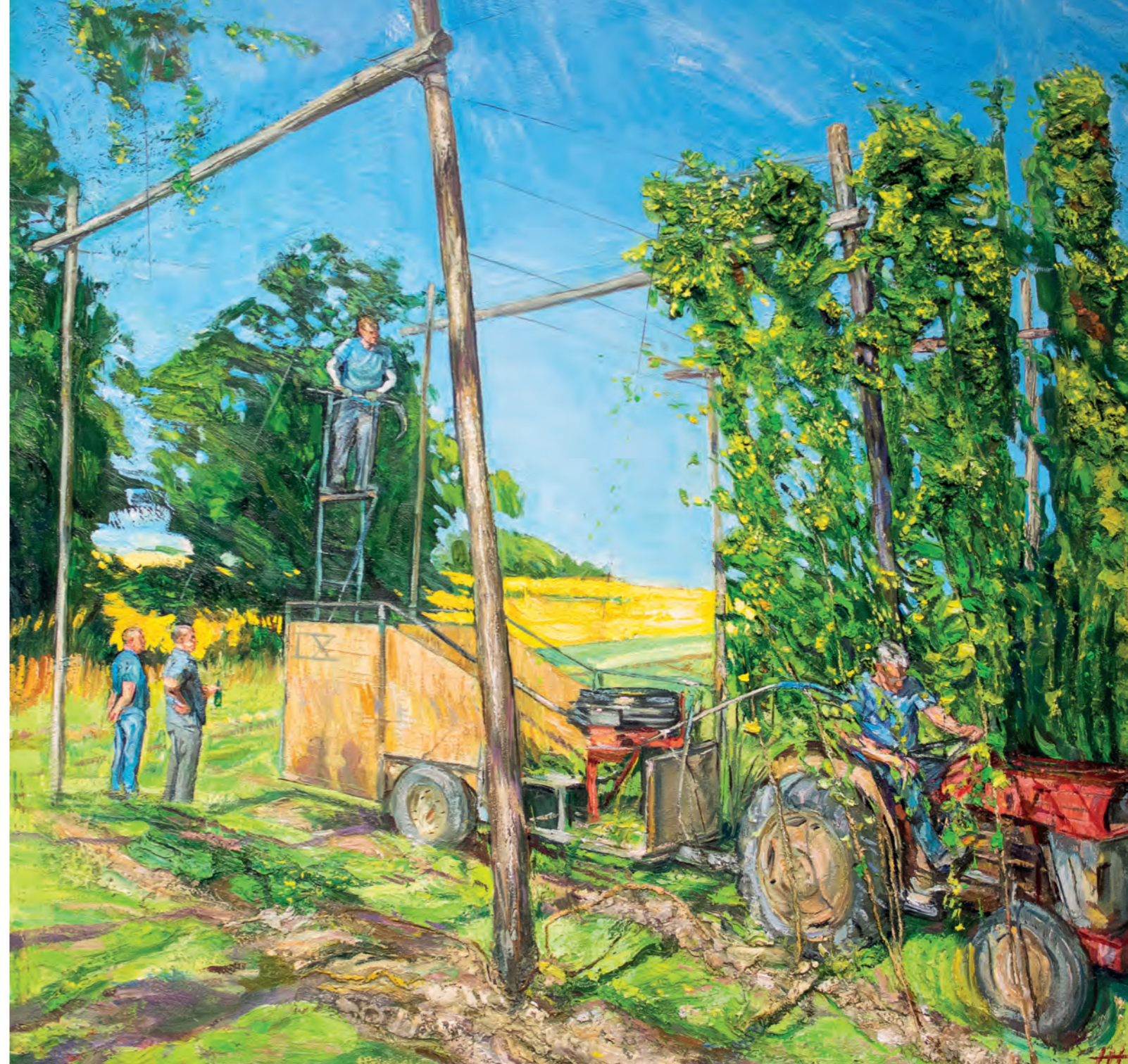
Hop Farm Smoking Oil on canvas 47 x 48 inches (right)