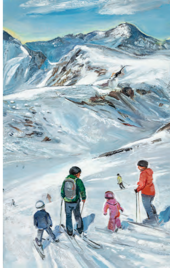
First Run Oil on canvas 36 x 23 inches