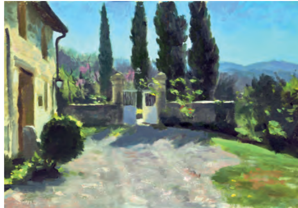
Jardin à Chabeuil Oil on canvas 15 x 22 inches