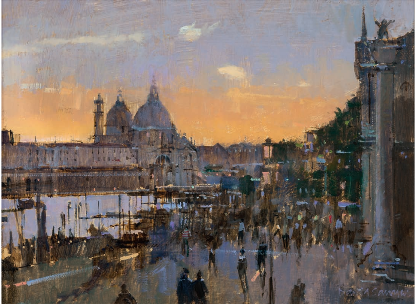
Self Portrait with Sea Bream Oil on canvas 31 x 12 inches (left)