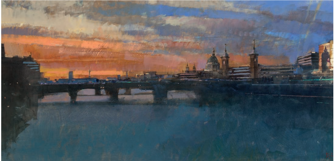
Late Winter Afternoon, Blackfriars Oil on board 16 x 24 inches