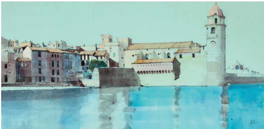
Reflections, Notre-Dames-des-Anges, Collioure Oil on board 12 x 24 inches (above)