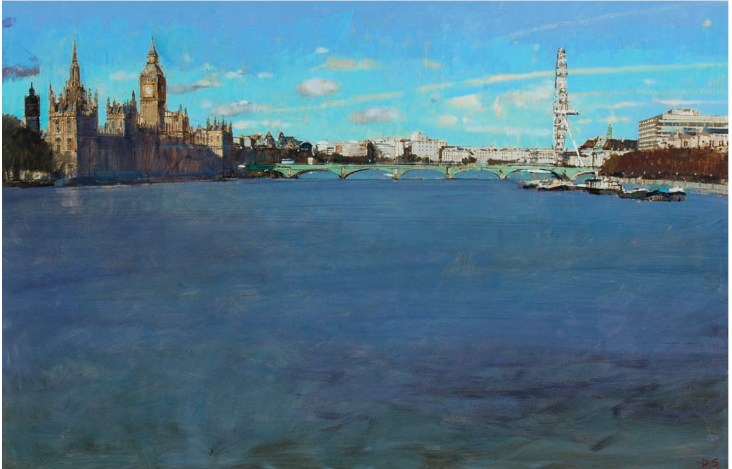
Towards Westminster - View from Lambeth Bridge Oil on board 24 x 36 inches