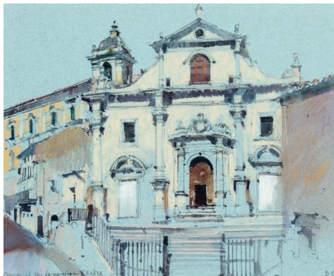
Chiesa del Purgatorio, Ragusa, Sicily Pastel and watercolour 12 x 15 inches (above)