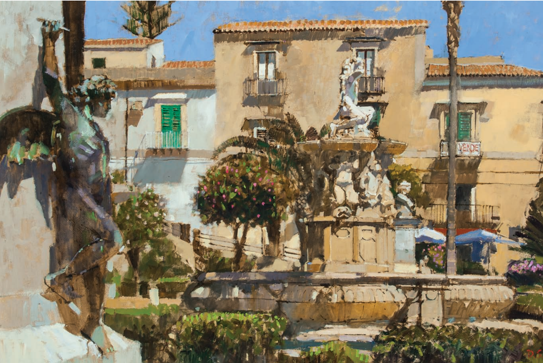
The Winged Bronze, Il Giardino de Barocco, Noto, Sicily Oil on board 24 x 36 inches