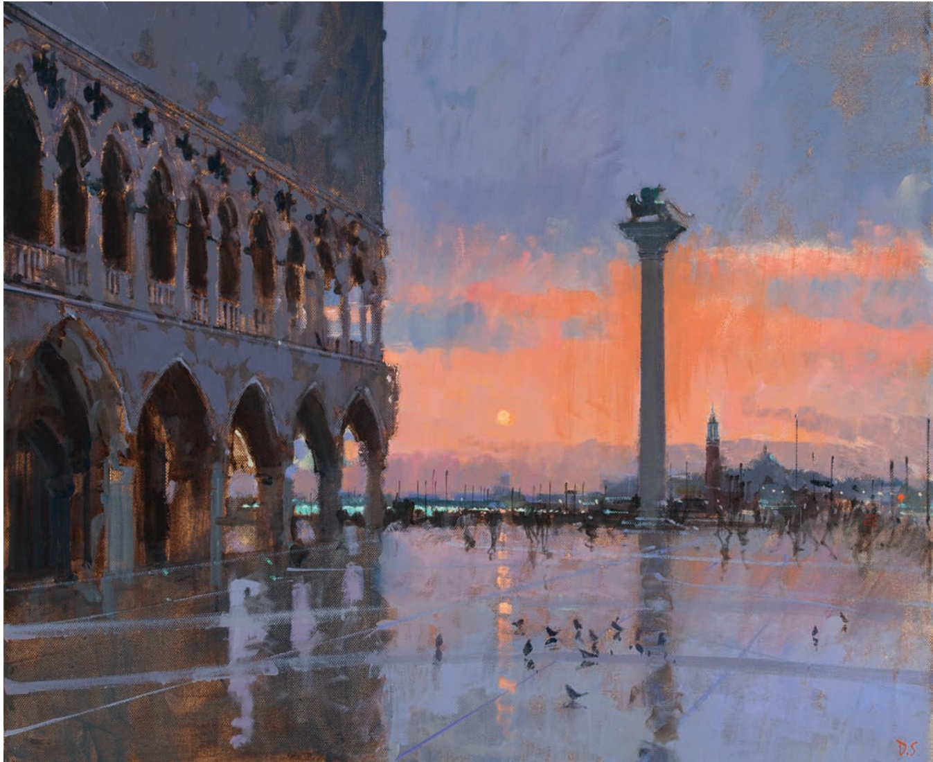
Blood Orange Sky Oil on canvas 20 x 24 inches