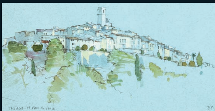
Terraces, St. Paul de Vence Watercolour 9 x 17 inches