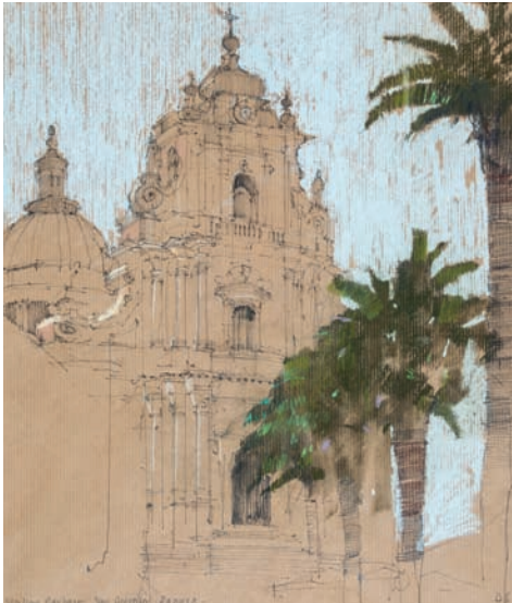
Study, Sicilian Baroque Pastel and pencil 17 x 14 inches (left)