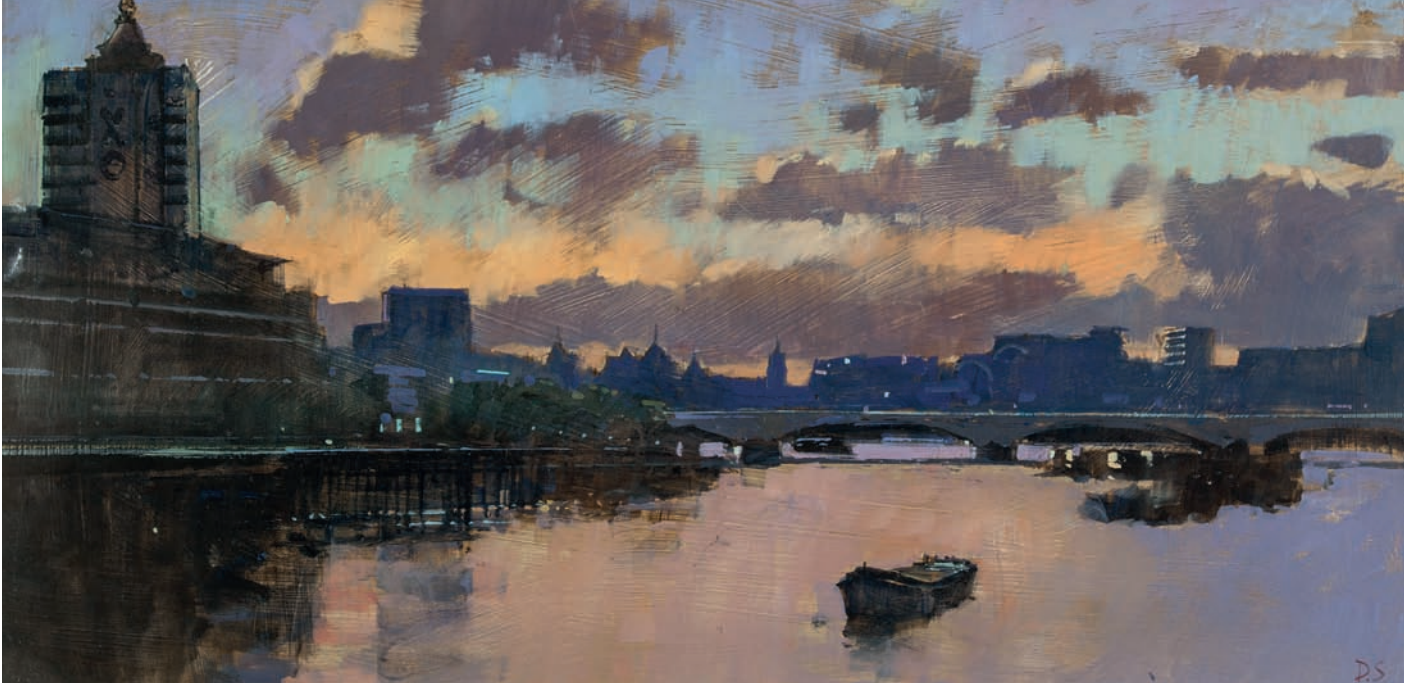
Evening Clouds, View from Blackfriars Bridge Oil on board 16 x 24 inches