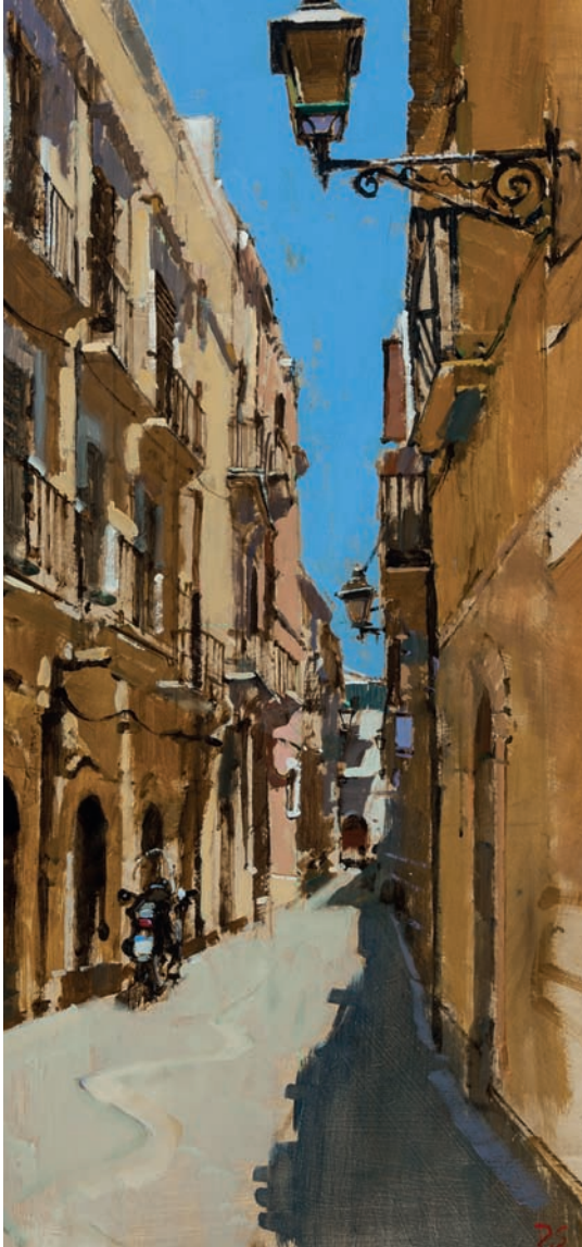
Sicilian Back Street, Ortigia Oil on canvas 10 x 20 inches