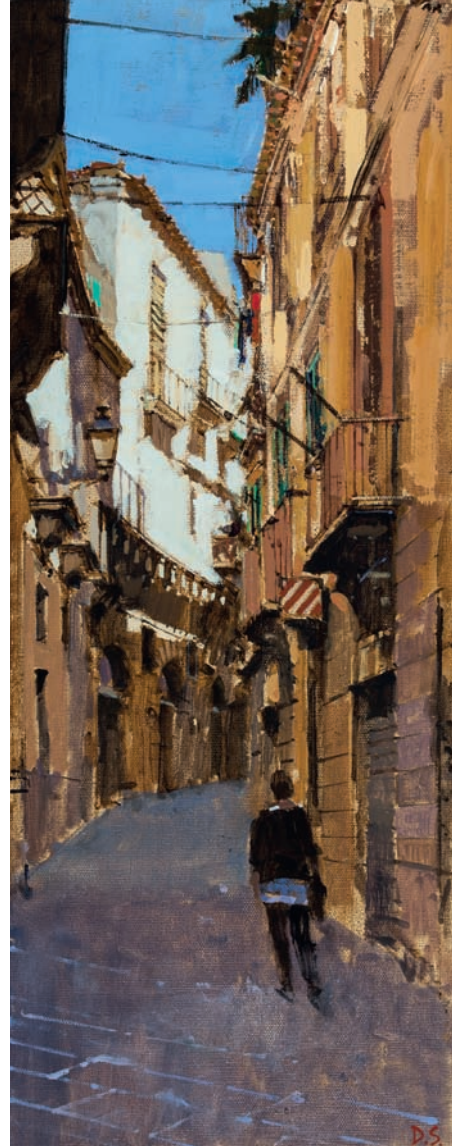
Sunlight and Shadows, Ortigia Oil on canvas 8 x 20 inches