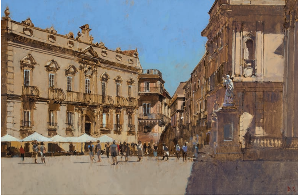
Palazzo Benvenuto, Ortigia, Sicily Oil on board 16 x 24 inches (above)