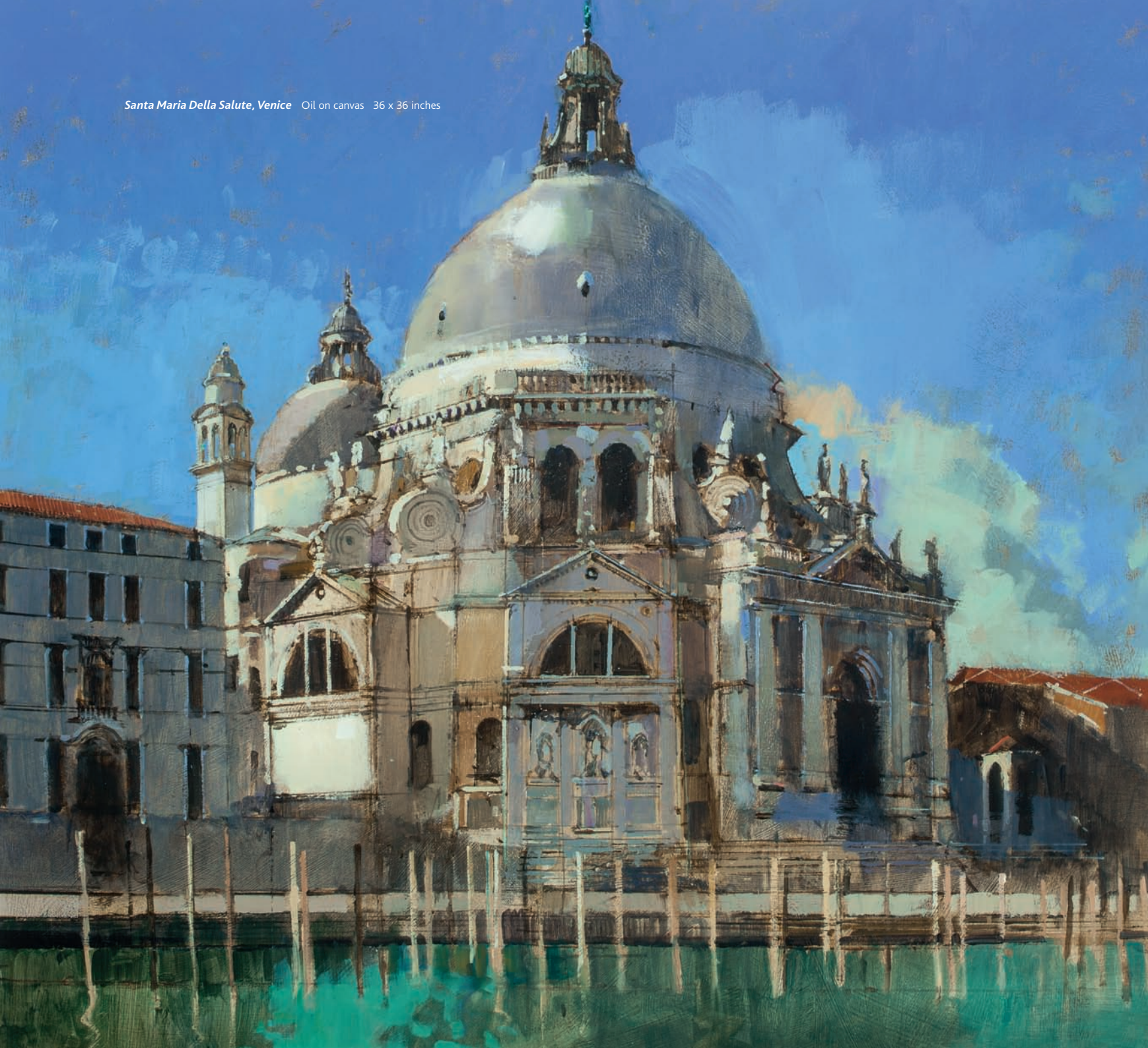
Santa Maria Della Salute, Venice Oil on canvas 36 x 36 inches