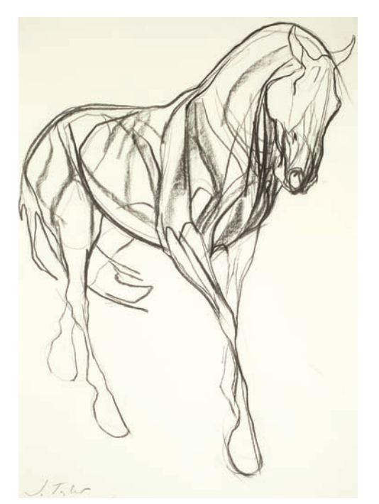
The Proposition (Study) Charcoal 33 x 22 inches