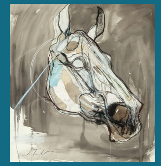
Fathom Mixed media on paper 36 x 34 inches

The Tempest Oil on Canvas 48 x 78 inches (front cover)