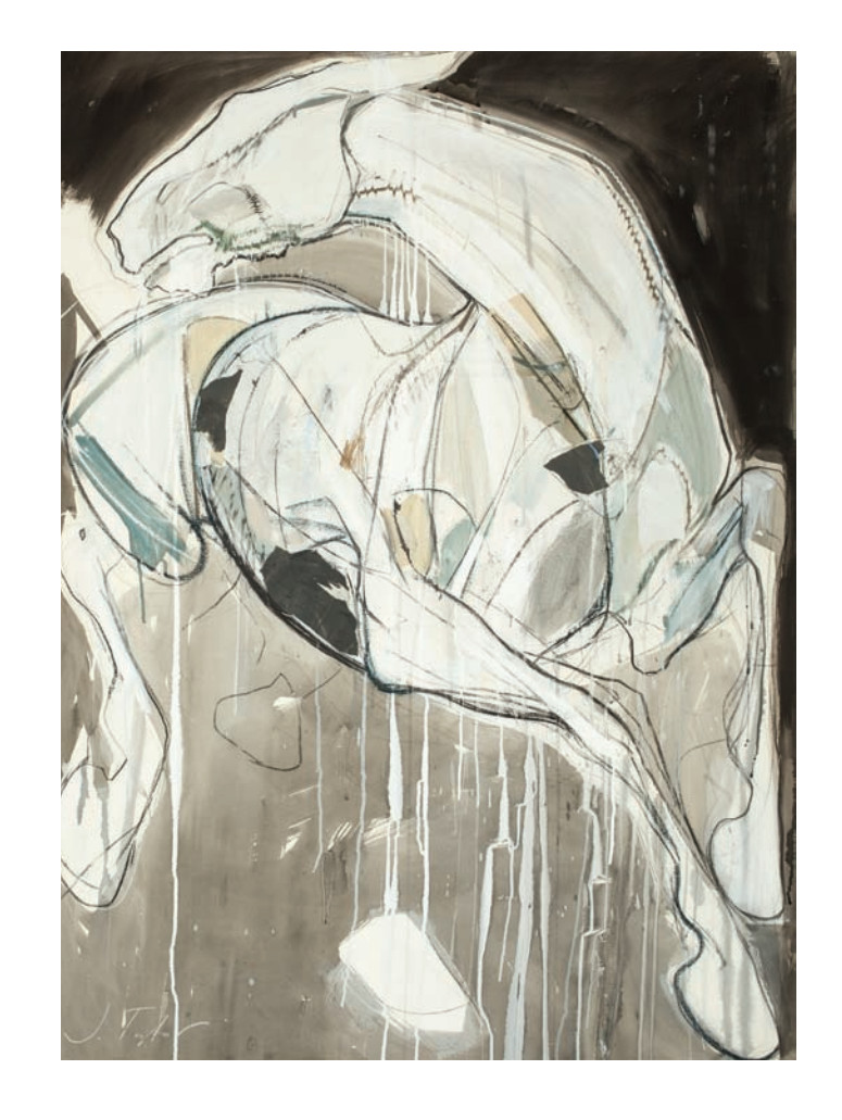
Ragged Crow Mixed media on paper 55 x 33 inches (top left)

Study for Irish Boys I Mixed media on paper 16 x 21 inches (bottom left)