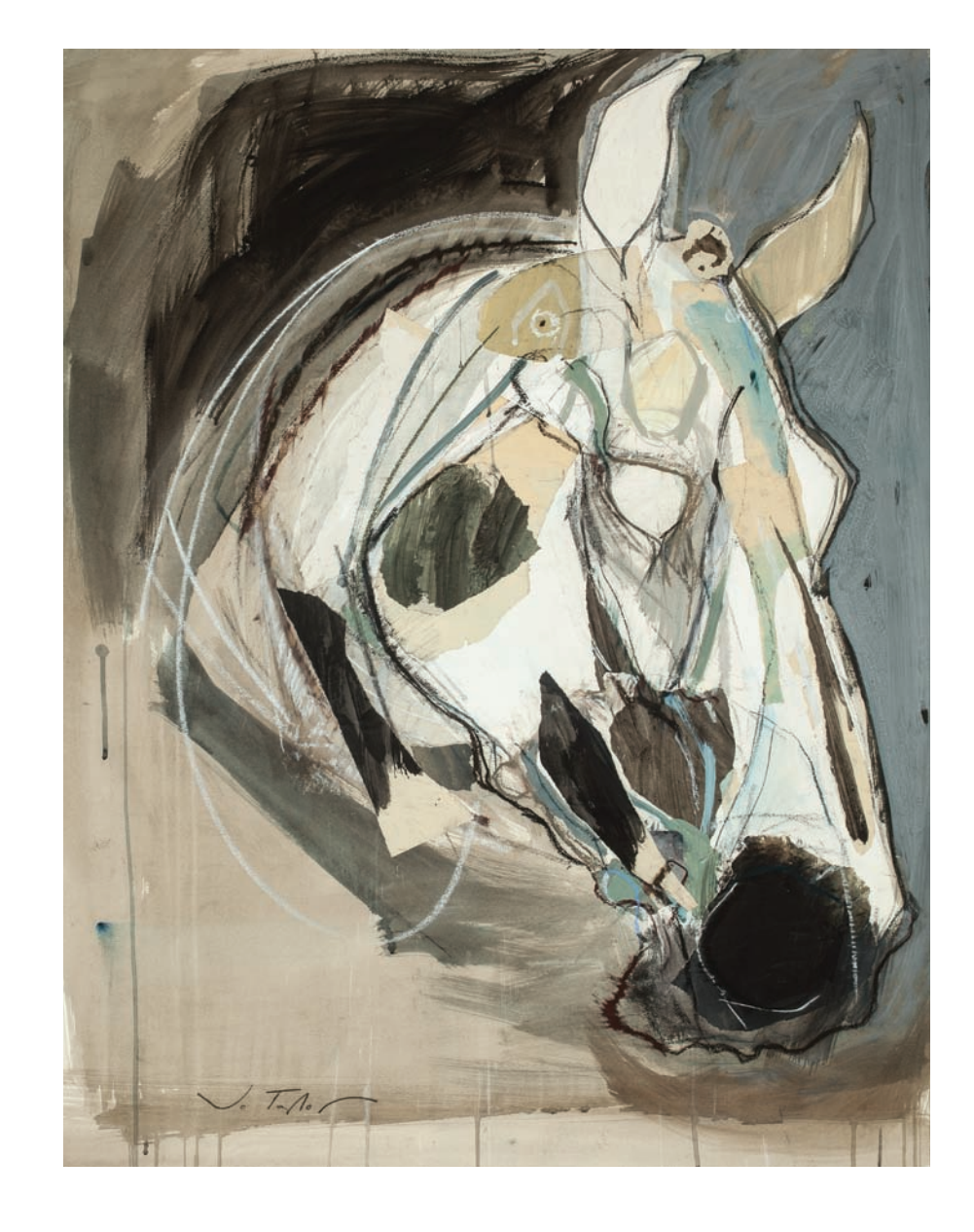
Hercules Mixed media on paper 41 x 33 inches

Johnny and the Stars Mixed media on paper 33 x 40 inches