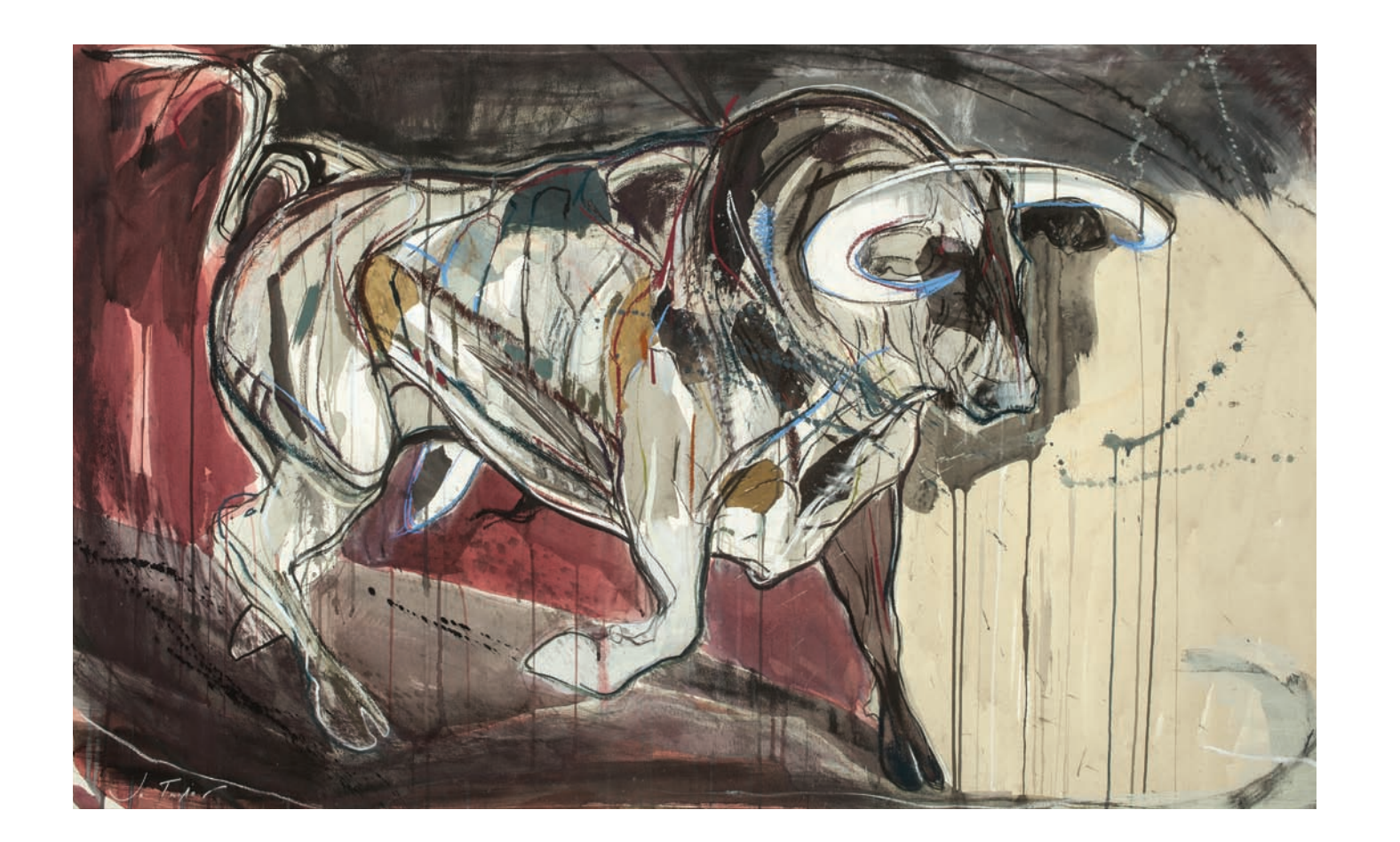
The Silent Assassin Mixed media on paper 34 x 60 inches