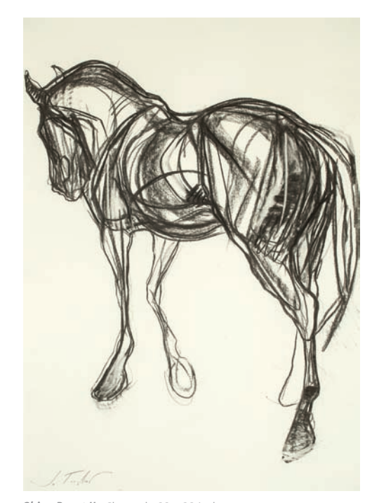
Shiny Beast II Charcoal 33 x 22 inches