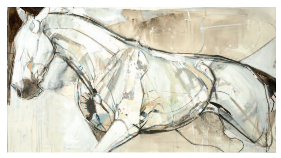
Luis' Horse Mixed Media 33 x 60 inches