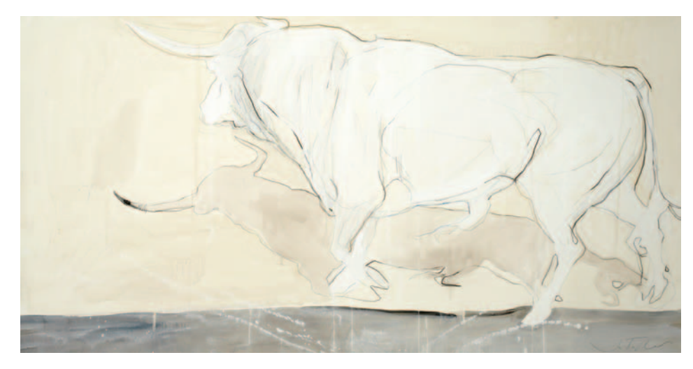
Pale Bull Mixed Media 31 x 56 inches