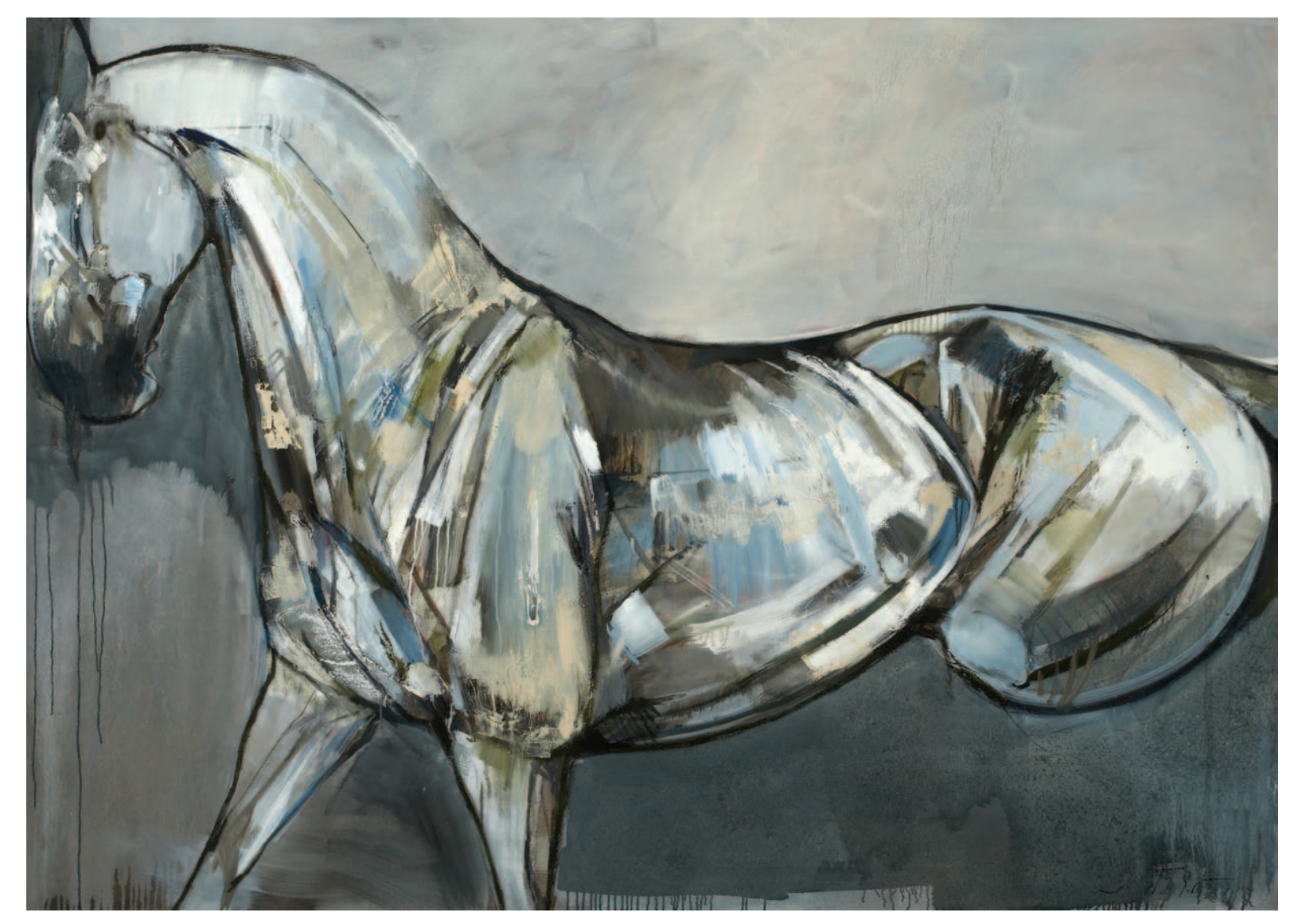
Phantom Oil on canvas 61 x 84 inches 3 Spiders Eggs Mixed Media 32 x 57 inches (left)