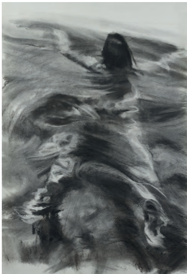
Glide Charcoal on paper 45 x 30 inches