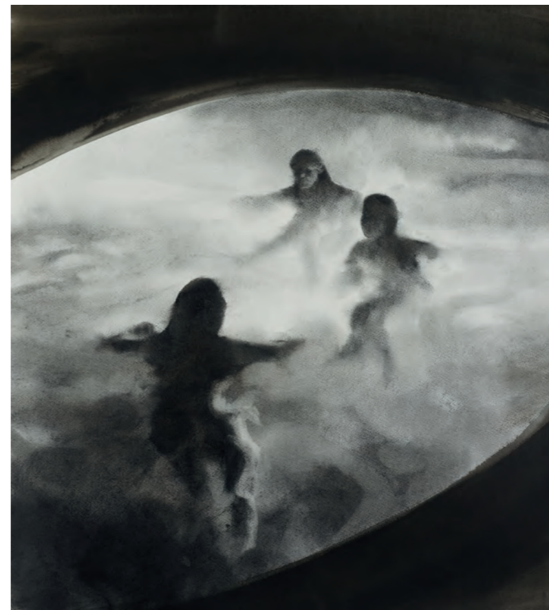
Night Swim Ink and charcoal on paper 25 x 22.5 inches