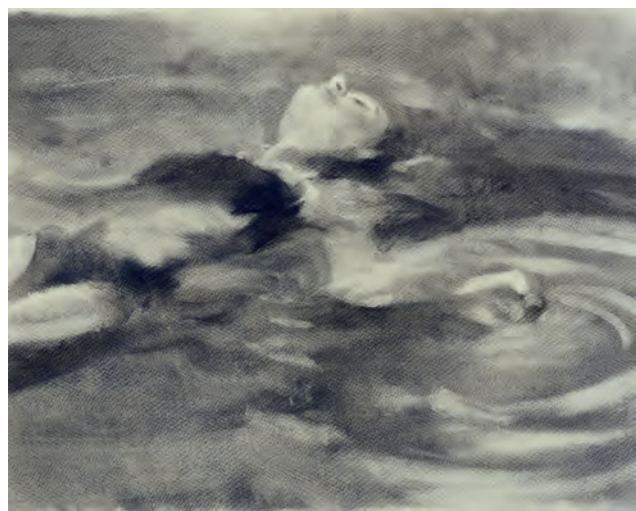
Contemplation (study) Charcoal on paper 12.5 x 16.5 inches