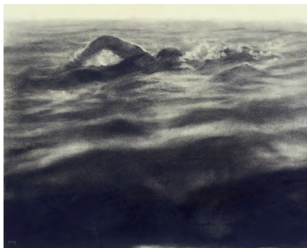
Open Water (study) Charcoal on vanilla paper 12.5 x 16.5 inches