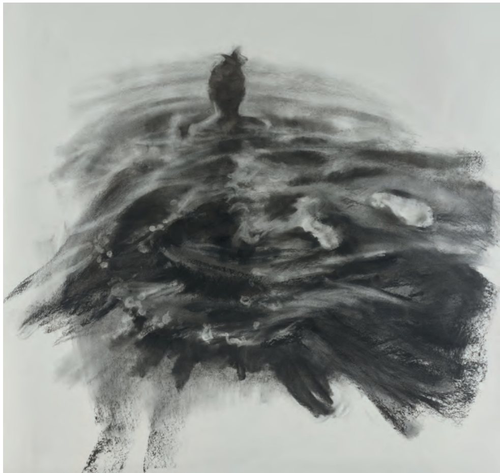
Echo Charcoal on paper 41 x 41 inches (left)