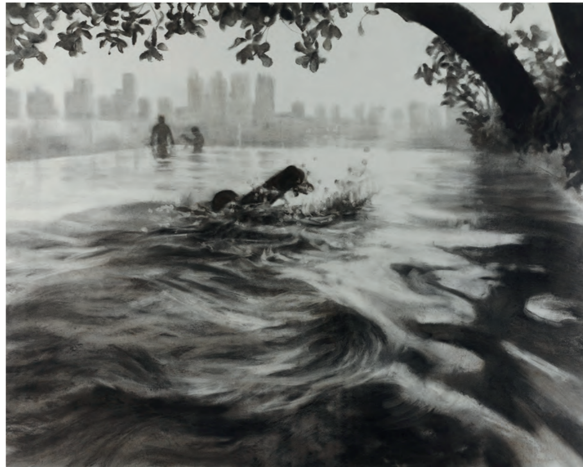
Golden Hour Charcoal on paper 45 x 56 inches (right)